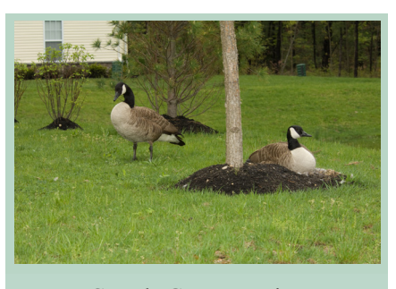
Canada Geese Nesting

Although nest and egg treatment/destruction is useful to curb population growth at a local scale, it should not be relied upon for immediate population reductions. Geese are long-lived birds (10-25 years in the wild) and they have a single, defined nesting season. Research indicates that elimination of nesting in a large scale regional effort would have to be conducted over many years before population stabilization would even occur. Regardless, management of goose nesting can be an important part of an overall integrated management approach to living with Canada geese in your community.