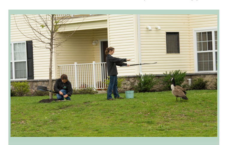
Nest Management is Best Done by a Team of Two People-One To Treat The Eggs and One To Keep The Geese Away From The Nest

Nest defense behavior by Canada geese is encountered after the nest is located and during the process of moving the adult goose off the nest. Geese must be moved to effectively treat the eggs.