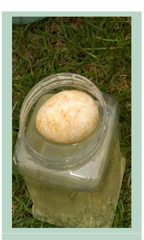
Egg is Floating and is Nearing its Hatching Date

Although the Nest and Egg Depredation Order allows treatment at any point during the 28 day incubation period, some individuals may prefer to restrict egg treatment to the first 14 days of incubation. The Canada goose "egg float test" can be used as a guide to determine the age of the incubating eggs. Below is a diagram that illustrates how eggs will act in water at different developmental stages, counting from the beginning of incubation (not from laying). Be sure you have a container of water with enough room and enough water so that eggs can float freely. At many sites, you can fill a bucket from the pond next to the nest but at some sites you may need to bring water with you. Place a minimum of two or three eggs in the water and use the diagram to determine their age.