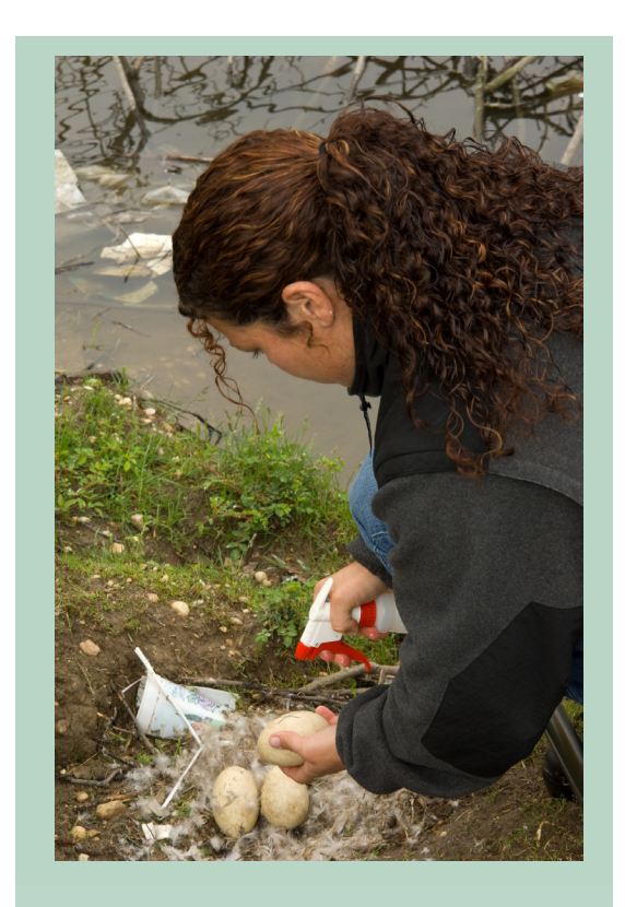
One Method of Oil Application to Canada Goose Eggs

Puncturing —It is not necessary to mark the eggs to be punctured; however, an individual may prefer to mark the eggs so they do not need to be handled during subsequent visits. To puncture the egg, hold it securely in your hand, braced against the ground. Insert a long, thin metal probe into the pointed end of the egg. Best results are attained by placing slow steady pressure. Once the probe passes through the shell, place its tip against the inside of the shell, and swirl with a circular motion. The puncturing tool may be an awl, ice pick, chicken/turkey basting tools, a turkey lacer, or any sturdy, thin metal probe. It is advisable to connect the tool to a lanyard or string with a piece of bright-colored flagging tape attached to assist in keeping track of it while you are working and traveling from nest to nest.